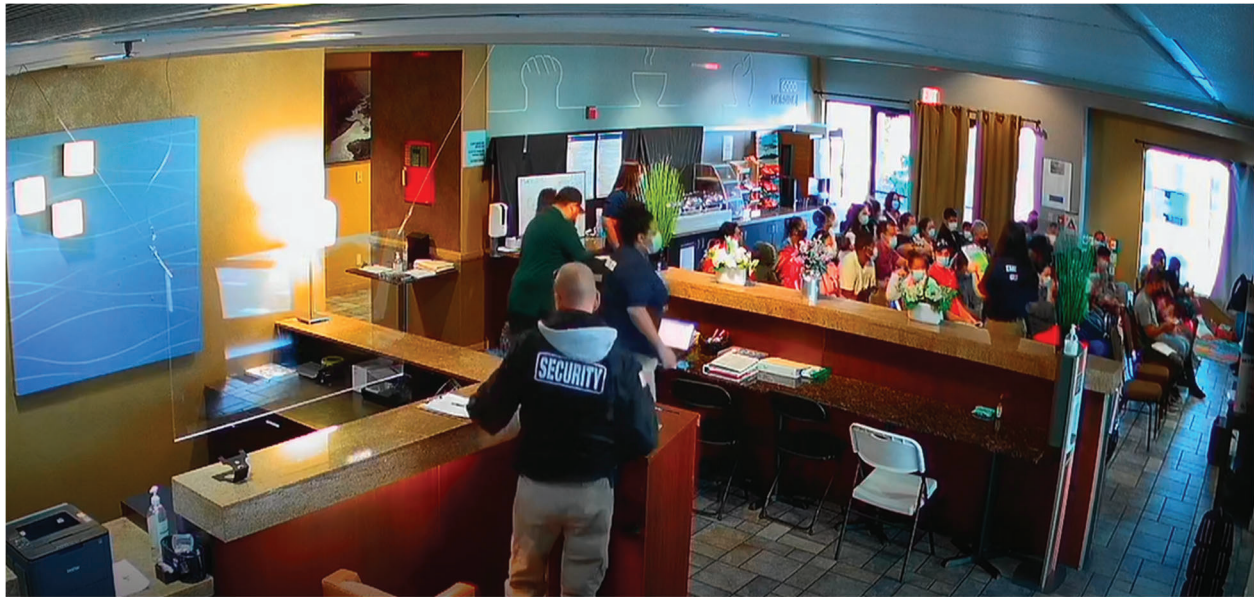
Figure 2. Migrants waiting to be processed at an ICE hotel in Phoenix, Arizona, in May 2021.

In March 2021, ICE modified its FRS 8 to establish guidelines for housing and caring for migrant families held in ICE custody at hotel locations operated by Endeavors, as pictured in Figure 2. The standards were customized for hotel locations to reflect that hotels are not intended to provide long-term residential care. The modified FRS kept some of the required standards intact but modified or removed several key standards that were not useful or appropriate for short-term stays. 9